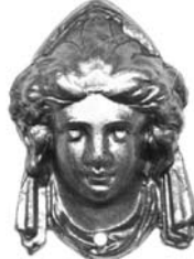
No. 11659 No. 11658 No. 11657